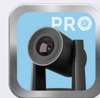
PTZ Control Pro 2