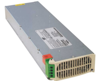
slide-in power supply for easy maintenance