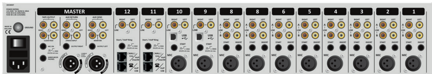
12 channel back panel