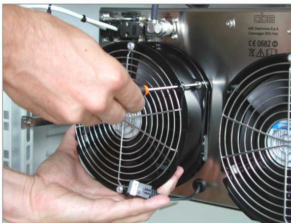
Ease of a substitution of a cooling fan: it is enough to disconnect the power plug and to remove 3 or 4 screws

The only maintenance to be carried out periodically is the cleaning