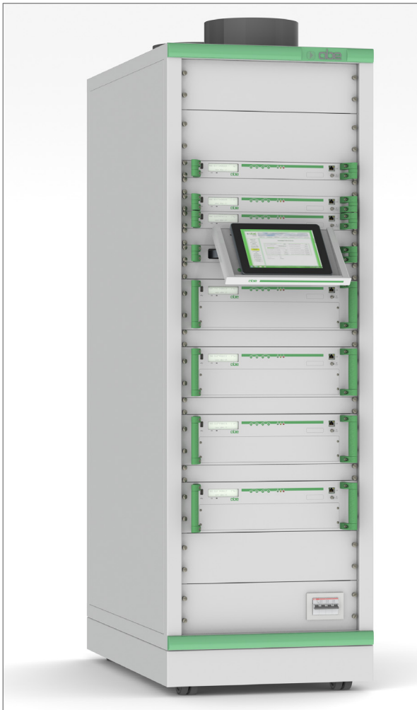
3.5kW Digital TV Transmitter High efficiency – Ducted Cooling

ABE Elettronica is proud to present the relevant new features introduced in the “MTX” Series of Multistandard – Multimode advanced TV Transmitters.