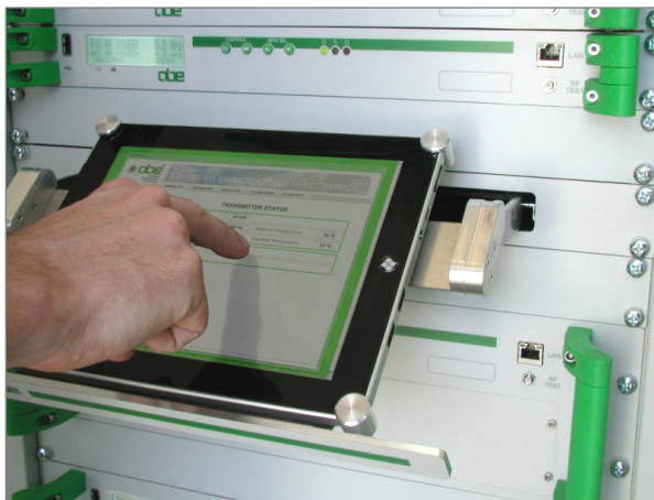
Transmitter "on board" tablet

The new high efficiency transmitters are part of the innovative