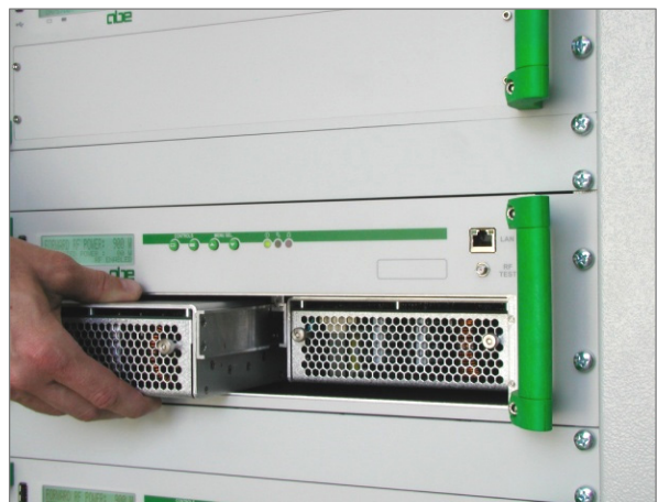
Ease of substitution of a power supply: it is enough to remove four screws

and/or replacing of the air filters and the modification of the air flow circuit in winter, if there is a likelihood of temperatures dropping below -5^{\circ}\text{C} .